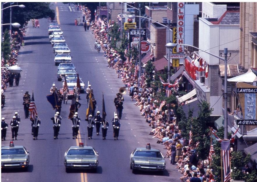
PARADES, PAGEANTS and more attracted tens of thousands of spectators.

There is no admission charge to the program, but, as always, donations are greatly appreciated.