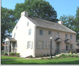
THE JENKINS HOMESTEAD