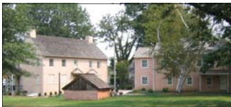
The Jenkins Historic Complex