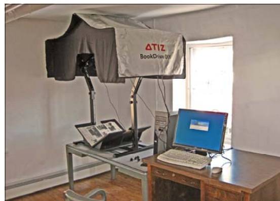
THE NEW Atiz reproduction equipment is now installed in the Jenkins Homestead.