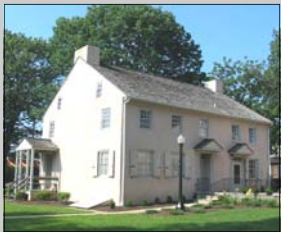
THE JENKINS HOMESTEAD

JUST OPENED FOR the Holiday History Tour in December, the Jenkins Master Bedroom was remodeled from top to bottom with new furnishings, a repaired and restained floor and freshly painted trim and walls.